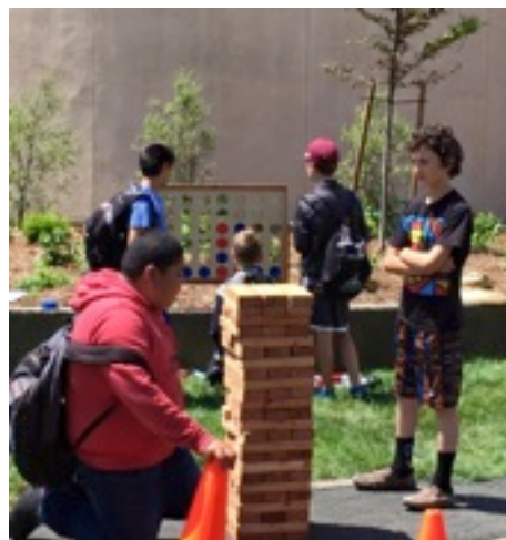
Giant Jenga at the Marin County Fair!