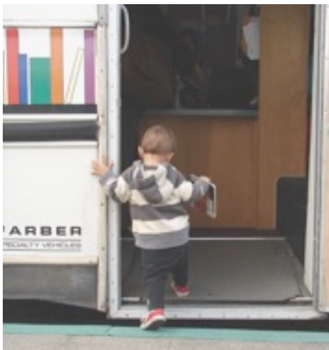
A trip to the Bookmobile is so much fun!

I hope everyone had a lovely summer and is ready for fall.