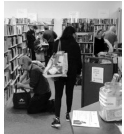
Happy shoppers at the Spring Clearance Sale—lots of wonderful books to find!