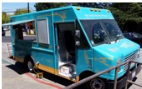
The "Try It Truck," ready for action!

Summer at the Corte Madera library: learning, exploring and fun! A definite highlight was the visit of the Bay Area Discovery Museum's "Try It" Truck, an engineering-lab-on-wheels that provides hands-on early engineering experiences to young learners, including high- and low-tech tools, while encouraging them to take risks and try new ideas. We transformed the garden, bike pad and Community Room into interactive engineering labs where kids could solve problems like how to build a raft that would float and support animal figures, how to build kites that could fly, create monsters from blocks of wood, how to disassemble things like DVD players and